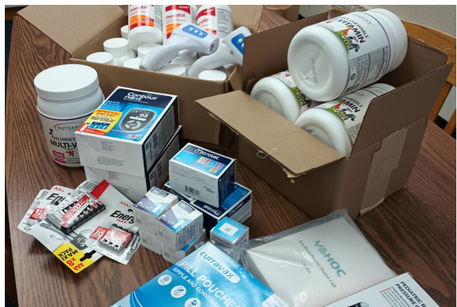
A local advertisement provides information for the February 2024 medical mission. Below, boxes of supplies are readied by the Sisters at Stella Niagara to be sent with the team.